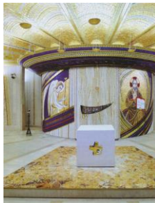
The new crypt where Padre Pio now rests.

Morning departure to San Giovanni Rotondo. En route we stop at Pietrelcina , birthplace of Padre Pio. We visit his home, the Church of Santa Ana , where he was baptized and we have Mass at Santa Maria degli Angeli . We stop at Piana Romana , where Padre Pio received the invisible stigmata, before continuing to San Giovanni Rotondo . Upon arrival we visit the Basilica of Our Lady of Grace . During our stay in San Giovanni Rotondo we visit Padre Pio's Tomb and the Casa Sollievo della Sofferenza founded by Padre Pio.