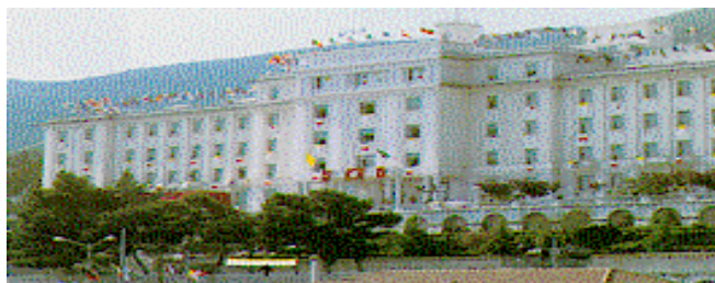
Casa Sollievo della Sofferenza (Home for the Relief of the Suffering)

Free day for private devotions and to join in the festivities.